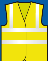
Class 2 Waistcoat