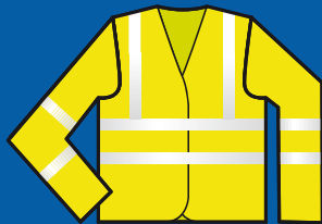
Class 3 Jacket